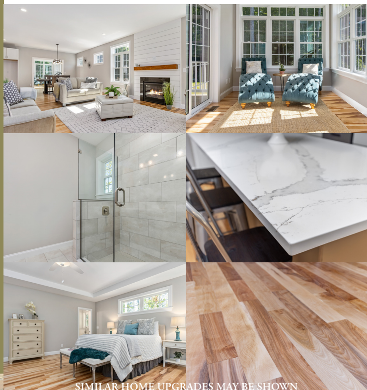
SIMILAR HOME UPGRADES MAY BE SHOWN